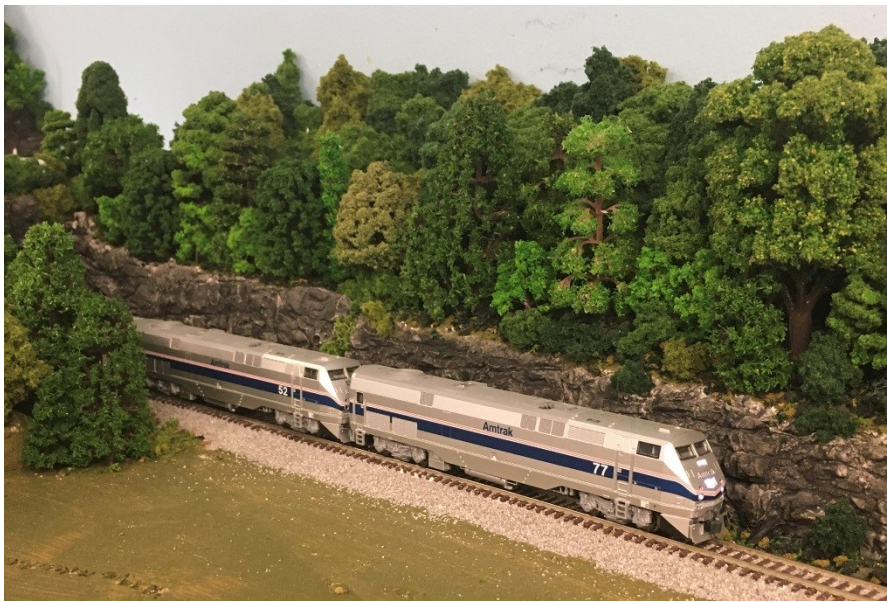
Bottom - "Tote Boats" on Steve's N Scale layout - October 15.