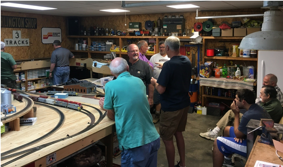
Top - October 8, at Keith's.